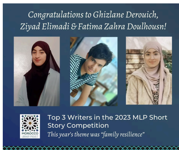
From the 3rd MLP Short Story Competition

The new collection of stories, from the 4 th Competition , is ready for final editing and publication. The theme is “civic responsibility,” with students writing about how to make a more civil society. At this point, the writers have already been honored at an event in Fes, the top three were awarded with prizes, and the teachers received stipends. Now we are seeking funding to turn the students’ accomplishments into a published anthology, which will need book design, layout, illustrations, printing, and distribution. This book will be distributed to libraries, classes, and individuals throughout the country and beyond.